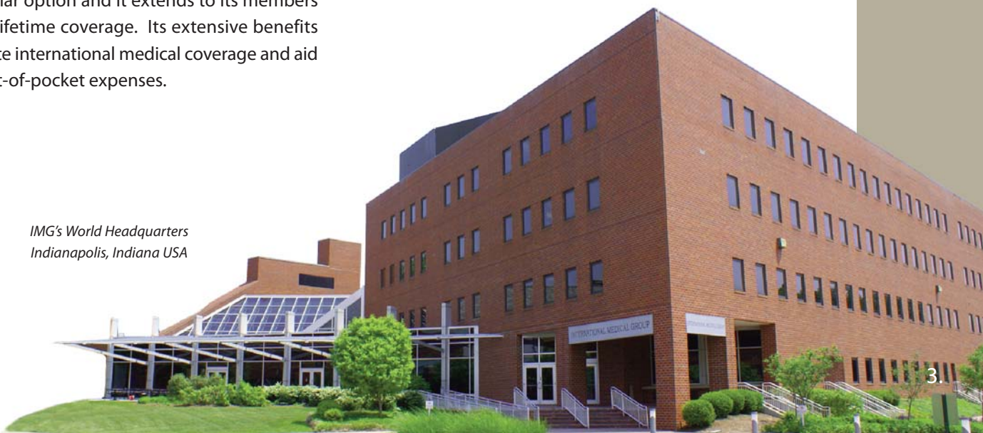
IMG's World Headquarters Indianapolis, Indiana USA

This option provides the superior benefits package for the most discerning global consumer. Platinum offers enhanced benefits and services with $8,000,000 of lifetime coverage. It is designed for the client who wants the convenience of comprehensive medical, dental, and vision benefits in one plan. The elite Platinum option also offers members access to our exclusive Global Concierge and Assistance Services SM (see page 5).